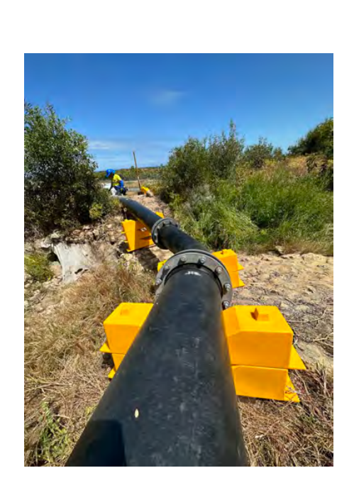
Delivering innovative solutions that work