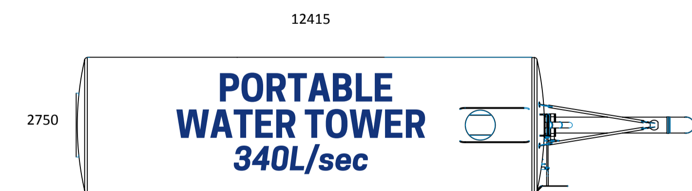
60,000lt TOTAL CAPACITY