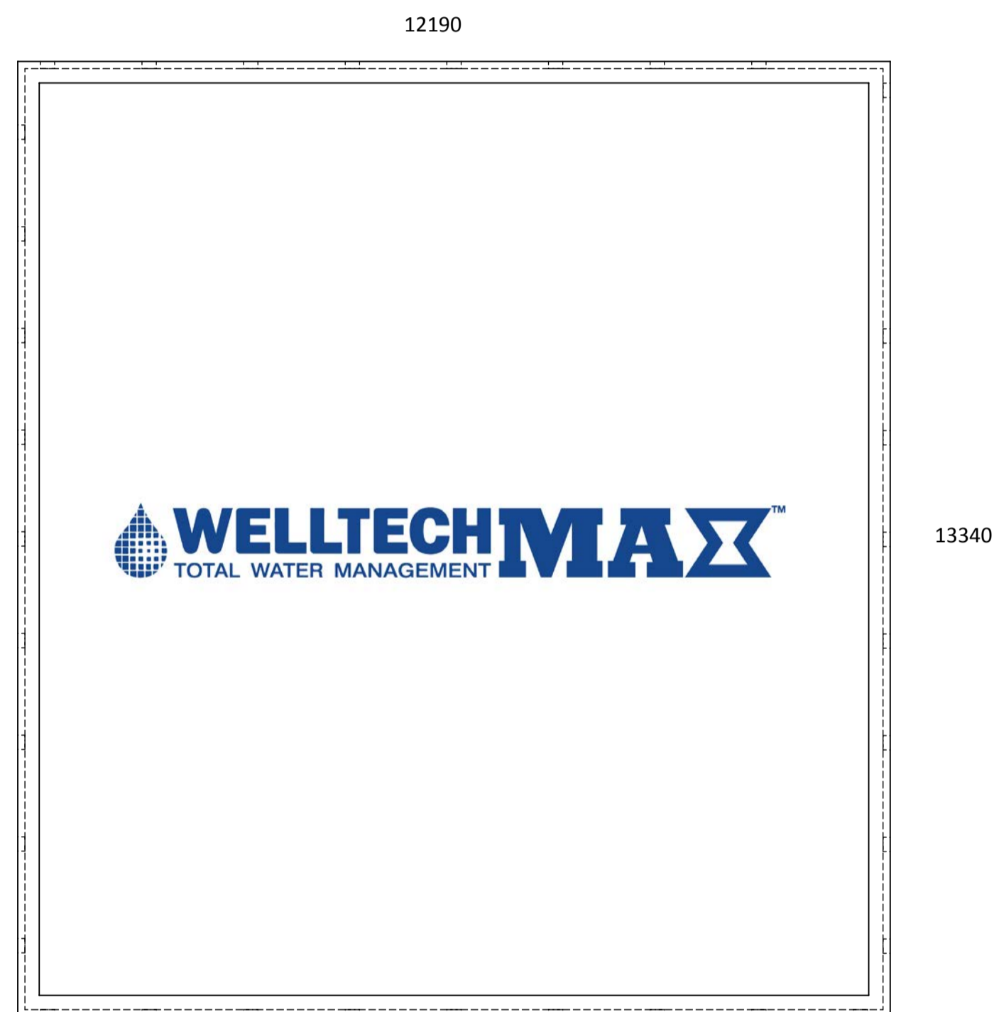
420,000lt TOTAL CAPACITY