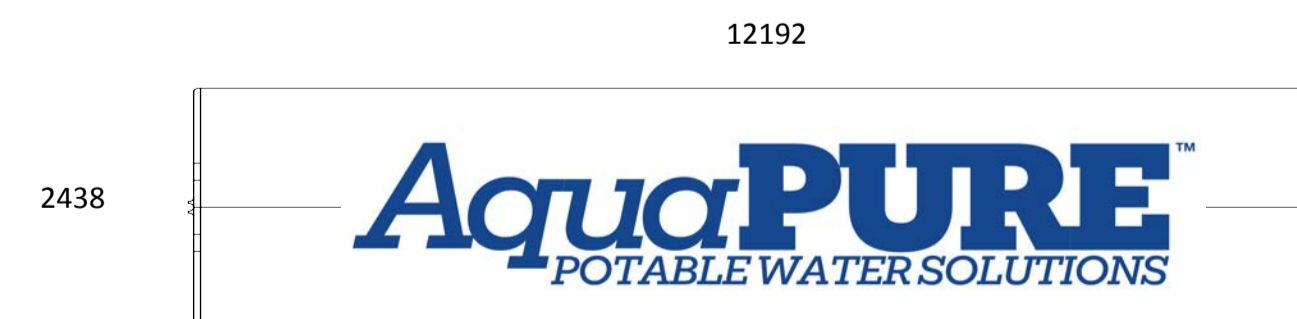
69,020lt TOTAL CAPACITY