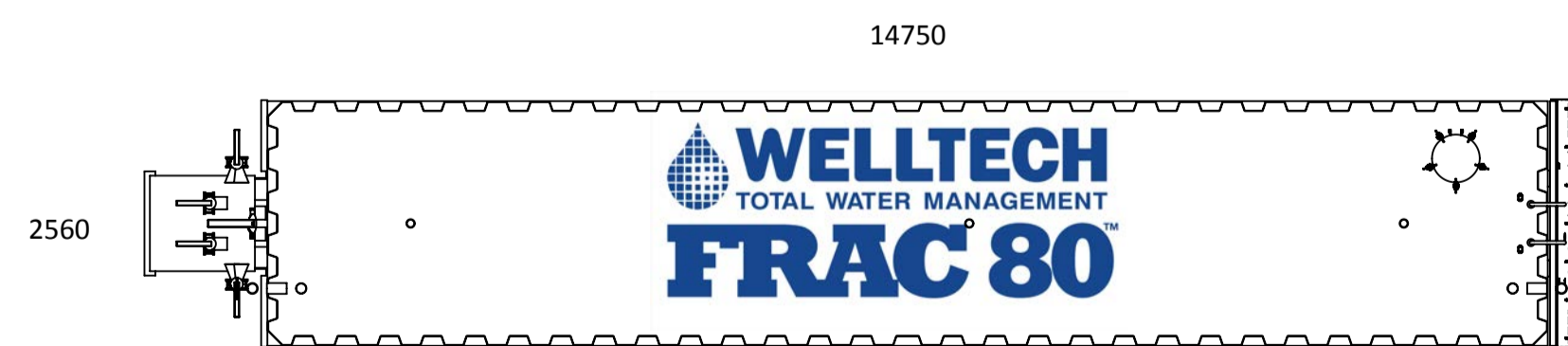
80,000lt TOTAL CAPACITY